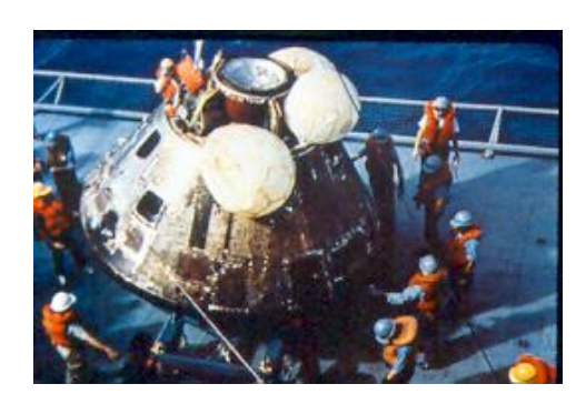
Captain Seiberlich on duty